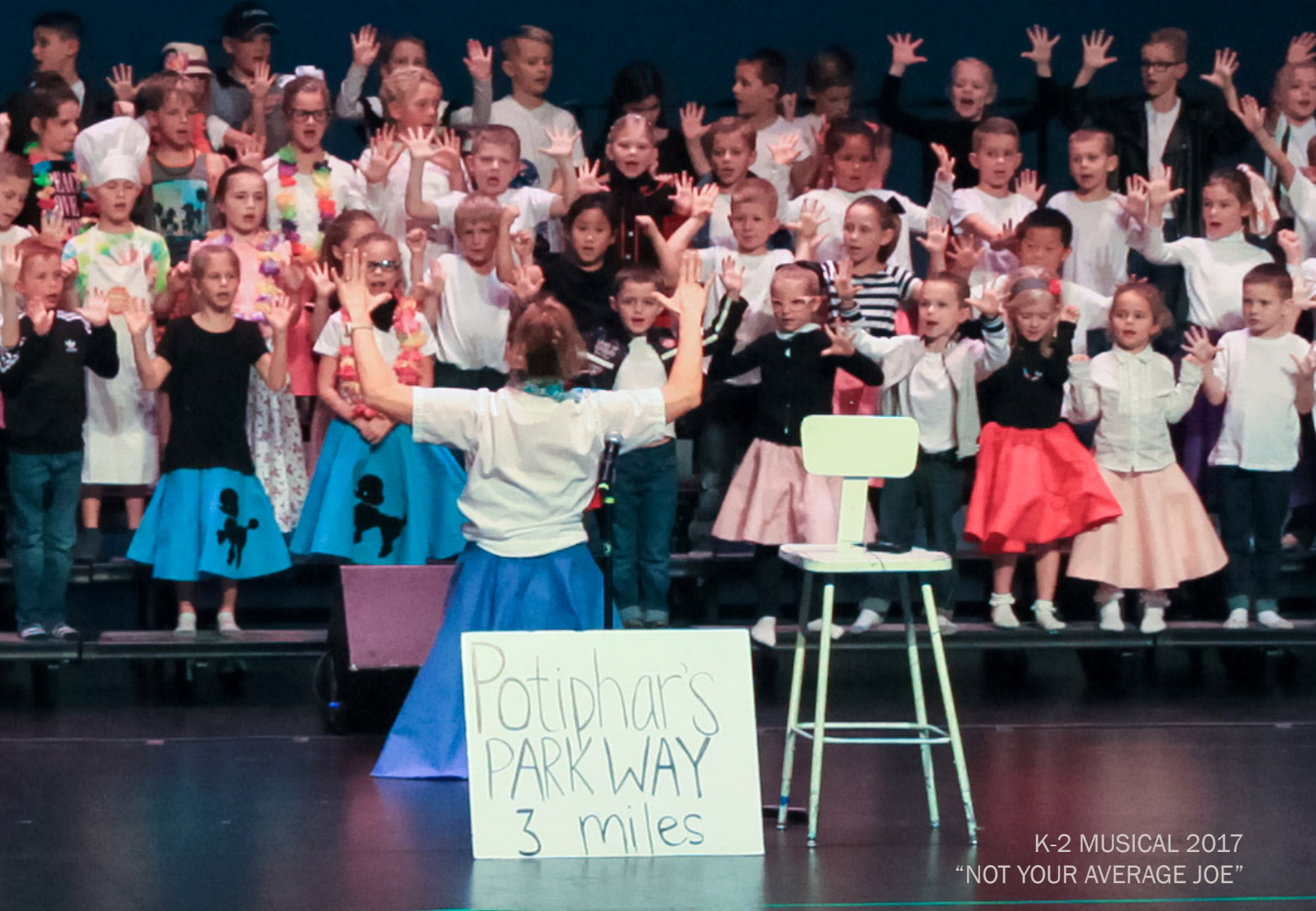
K-2 MUSICAL 2017 "NOT YOUR AVERAGE JOE"