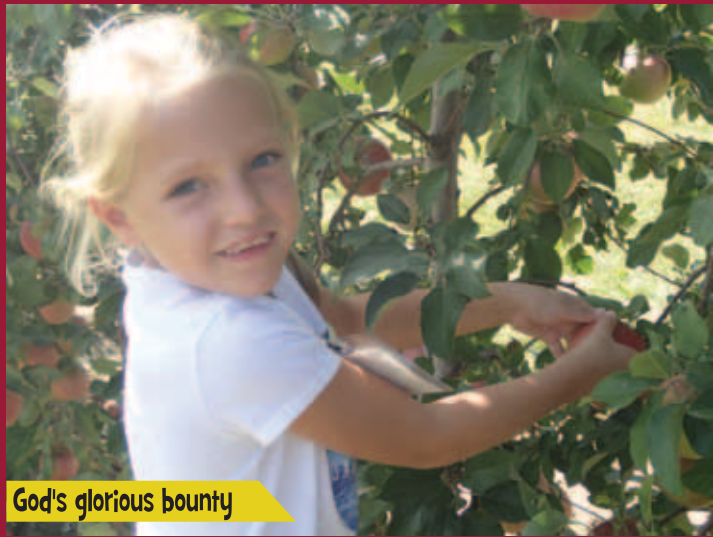
God's glorious bounty