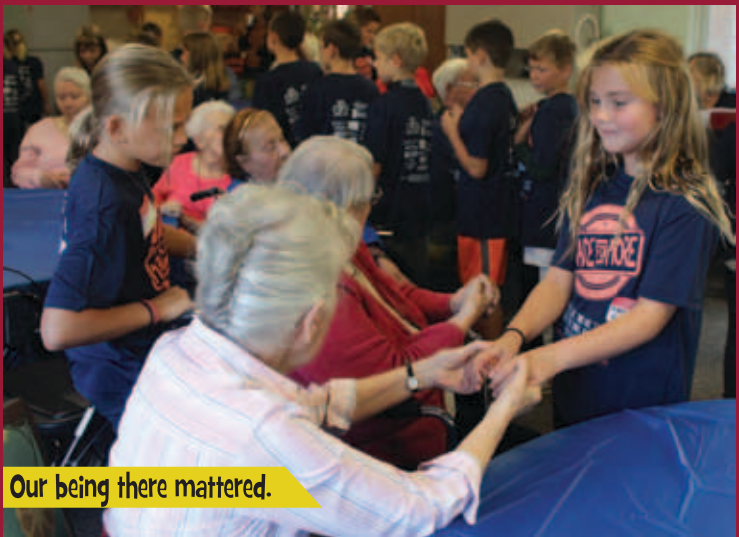
Our being there mattered.