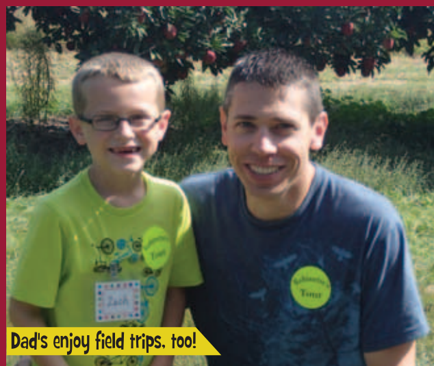
Dad's enjoy field trips, too!