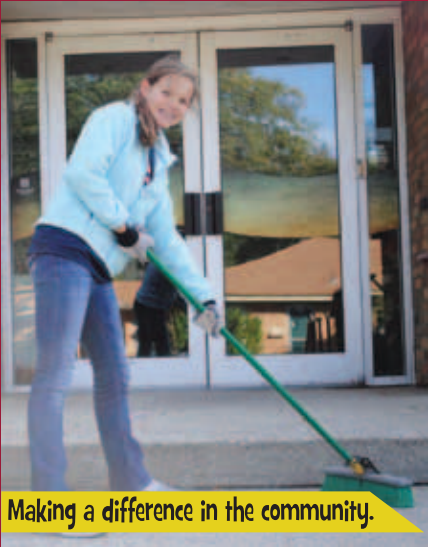
Making a difference in the community.