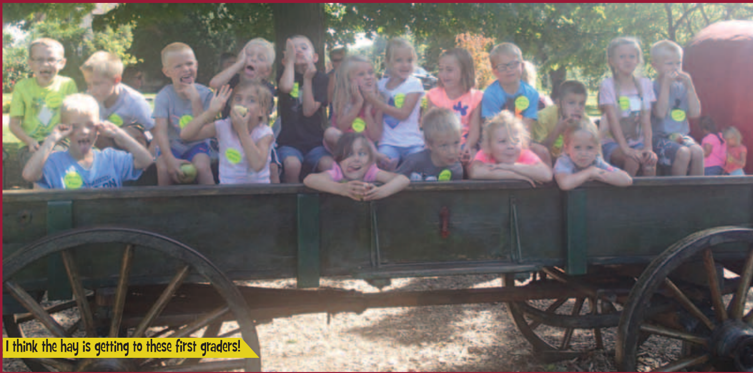
I think the hay is getting to these first graders!