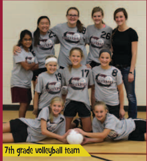
7th grade volleyball team