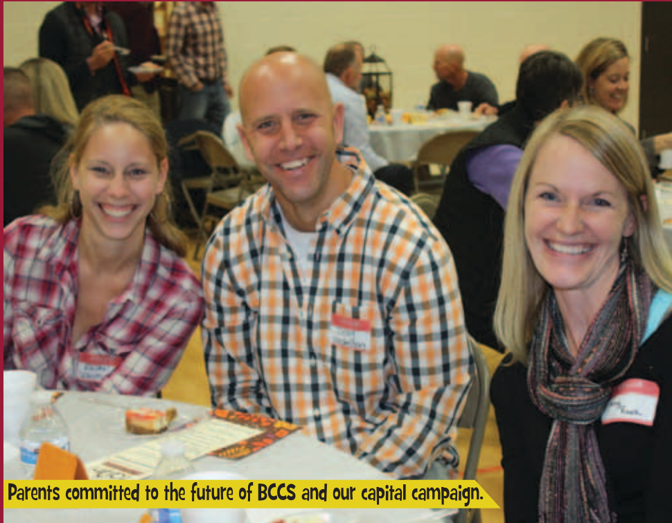
Parents committed to the future of BCCS and our capital campaign.