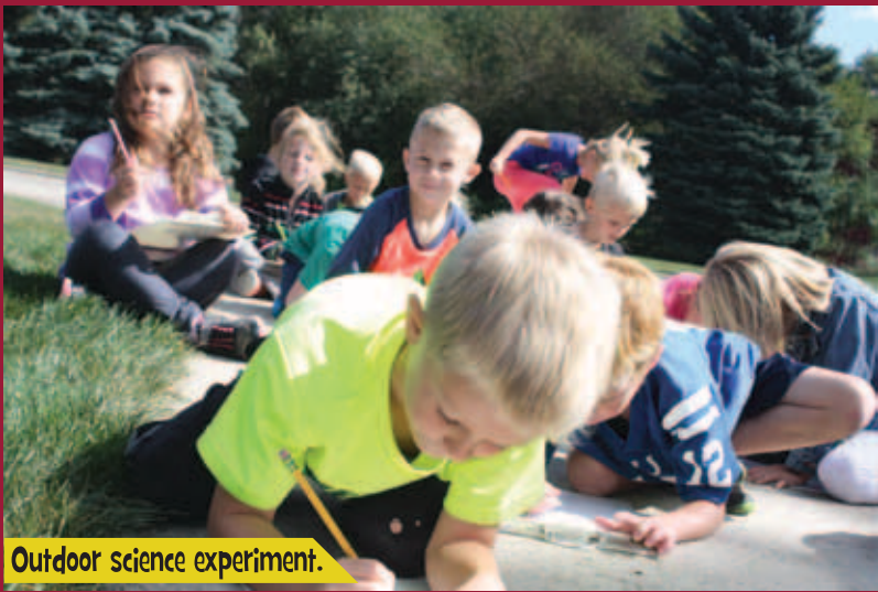
Outdoor science experiment.