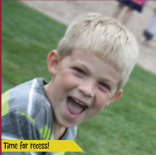
Time for recess!