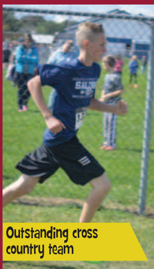
Outstanding cross country team