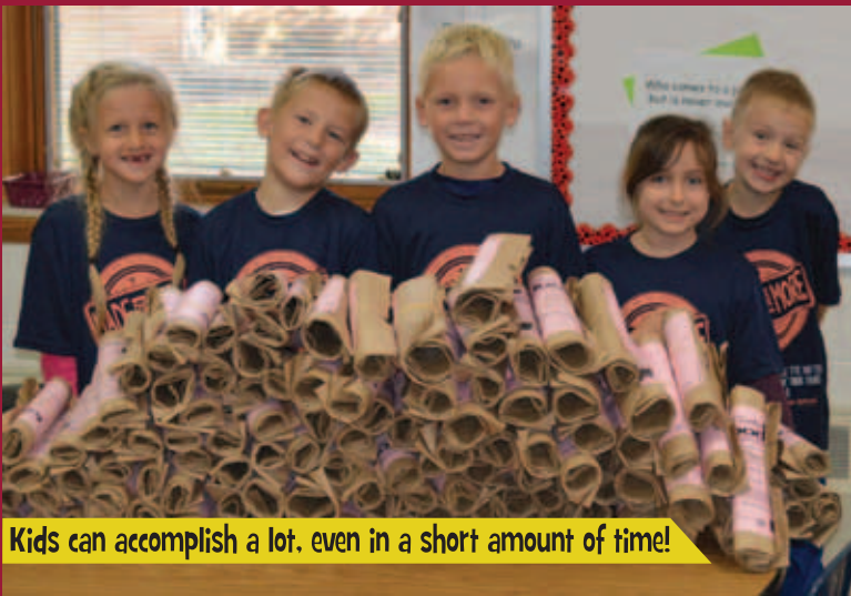
Kids can accomplish a lot, even in a short amount of time!