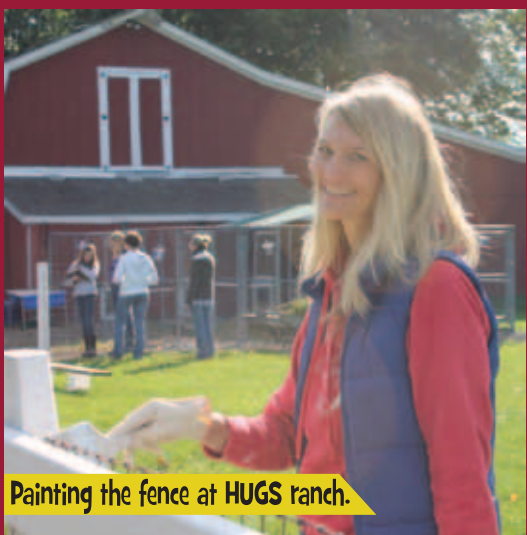
Painting the fence at HUGS ranch.